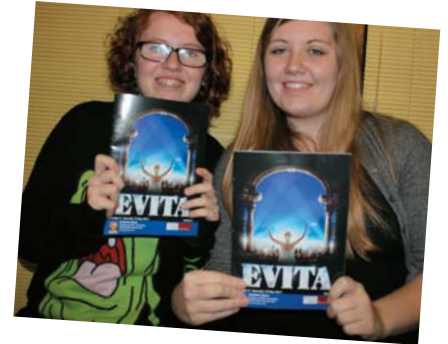
A night out in Bristol to see Evita