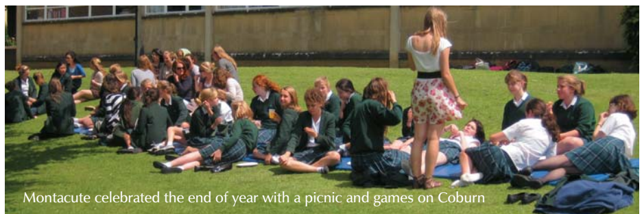
Montacute celebrated the end of year with a picnic and games on Coburn