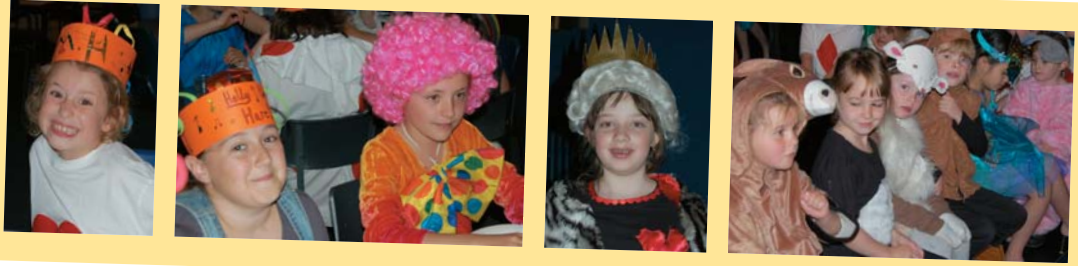
Children enjoy the performance and post production party for Alice in Wonderland