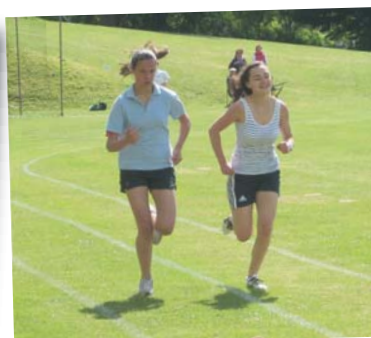
Battling it out on the home straight