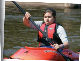
Boarders messing about on the water