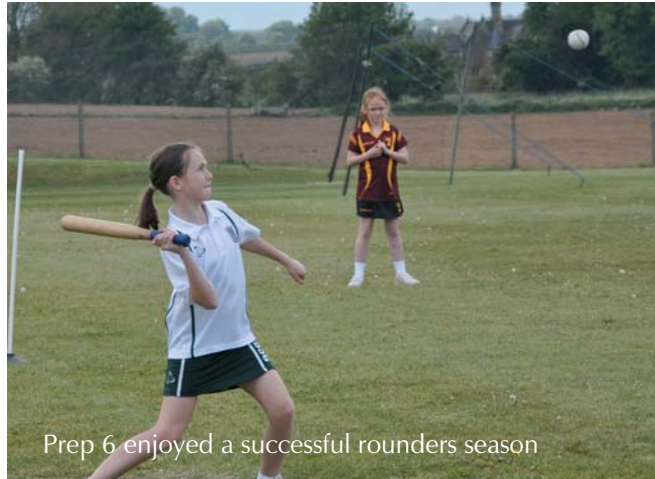
Prep 6 enjoyed a successful rounders season