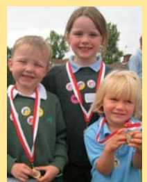
Pupils have fun at the Pre-Prep Sports Day