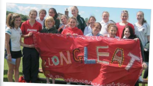
Supporters cheer on Longleat