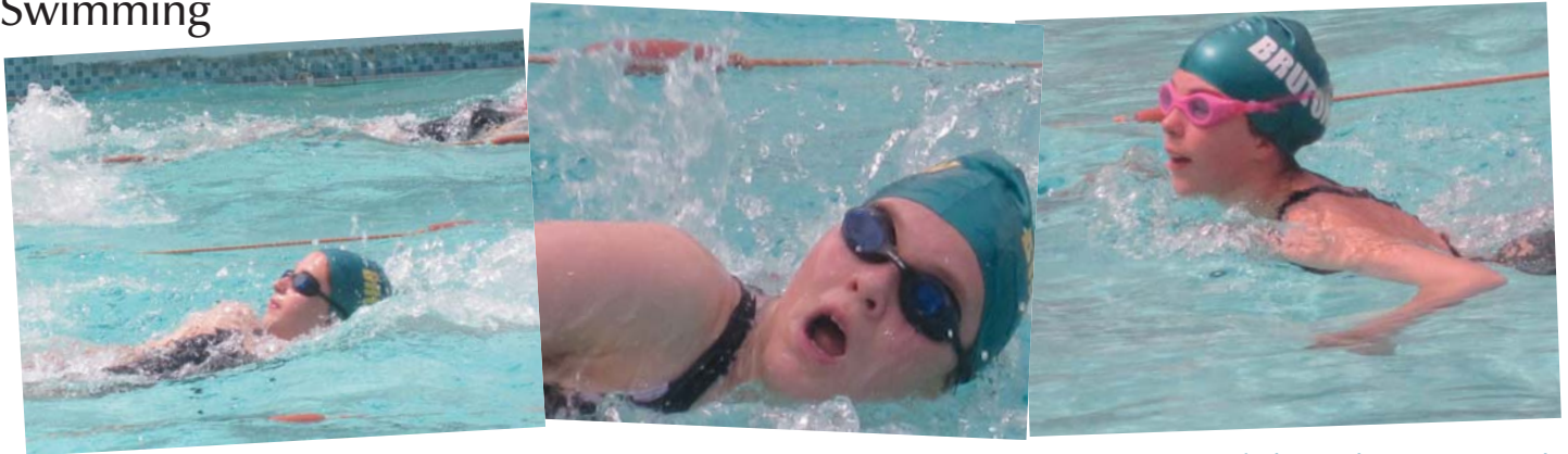
An impressive array of talent at the Swimming Gala