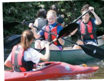
Boarders enjoyed the traditional camping weekend